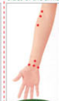
Acupunctured points on the palms