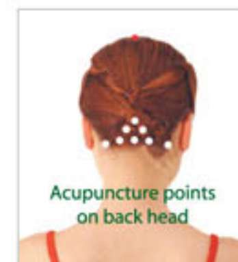
Acupunctured points on back head