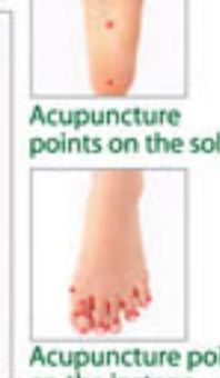
Acupunctured points on the insteps