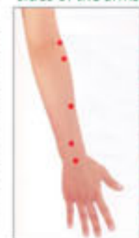
Acupunctured points on inner sides of the arms