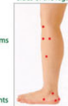
Acupunctured points on inner sides of the legs